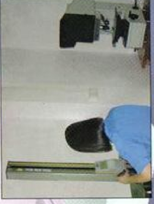
迴車加工 CNC Turning