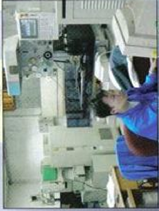
迴車加工 CNC Turning