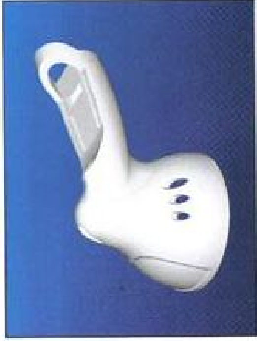
3D圖檔 3D drawing