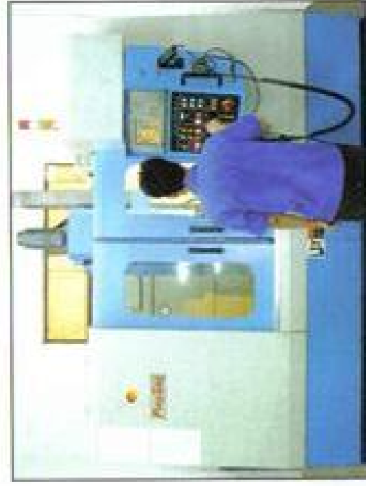
CNC加工 CNC Processing